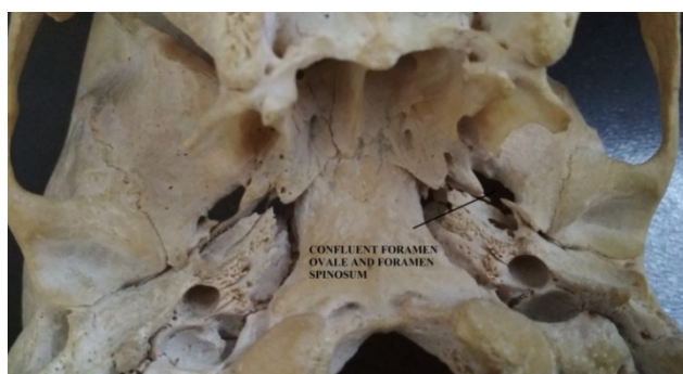
Fig. 5: Photograph of base of skull showing Confluent foramen ovale and foramen spinosum.

surgical importance, there are not many studies on skull base foramina from this part of India. Stenosis or presence of a bony spicule within the foramen ovale may result compression effect over mandibular nerve producing different clinical symptoms.