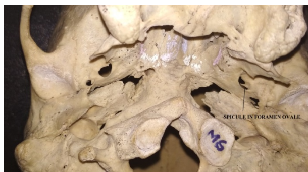
Fig. 3: Photograph of base of skull showing left foramen ovale is oval in shape and a bony spicule is projecting within the foramen ovale.