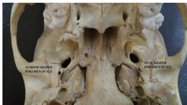
Fig. 1: Photograph of base of skull showing almond shaped right foramen ovale and oval shaped left foramen ovale.

Transcutaneous approach of Gasserian ganglion for surgical intervention of trigeminal neuralgia which is performed through foramen ovale makes the foramen significant for assessment regarding its shape and dimensions. Current trends toward percutaneous biopsy of cavernous sinus tumor through foramen ovale 2 and placing electrode in foramen ovale for evaluating seizures in patients who undergone amygdalohippocampectomy 3 has increased the risk of mandibular nerve injury to some extent. Moreover inadvertent injuries to Mandibular division of trigeminal nerve during different neurosurgical procedures can result in varied and grave symptoms. In spite of increasing microsurgical techniques and their considerable