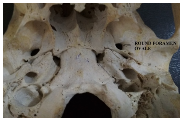
Fig. 2: Photograph of base of skull showing round shaped left foramen ovale.