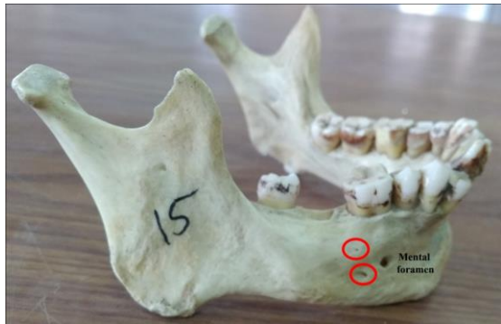
Fig. 5: Two accessory mental foramina (circled) found postero-superior and postero-inferior to main mental foramen