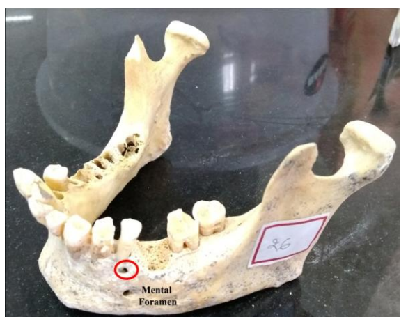
Fig. 4: Accessory mental foramen (circled) found anterosuperior to main mental foramen near the canine root