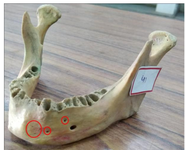
Fig. 3: Five accessory mental foramina (circled)