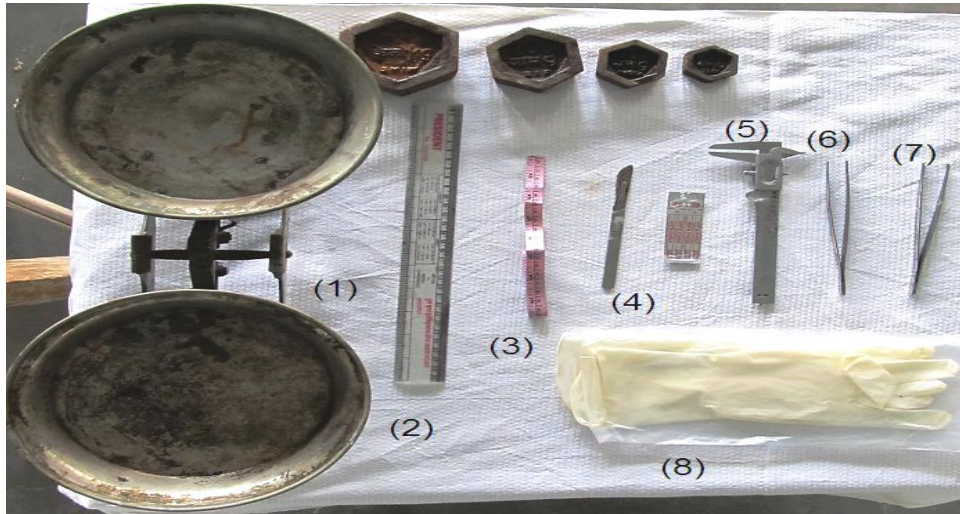
Fig 22: Measuring instruments: 1. Weighing machine with weights; 2. Measuring scale; 3. Measuring tape; 4. Scalpel with surgical blade; 5. Vernier calliper; 6. Forceps blunt; 7. Forceps toothed; 8. Gloves

Statistical analysis was done by using: 'Z' test and 'Tukey' test to measure difference between two mean Calculated by SPSS version 18.