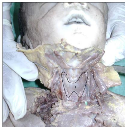
Fig. 1a: Thyroid gland in aborted foetus (insitu) by dissection method

gland from its neighbouring structures in the neck was done by dissection method. The physical measurements of the thyroid gland i.e. length, width, thickness and weight were recorded (Fig. 1a). The specimens were categorized into 16-24 weeks, 26-34 weeks and \geq 36 weeks of gestational ages. We have evaluated the thyroid volume by using ellipsoid method equation ( \pi / 6 \times \text{Length} \times \text{Width} \times \text{Thickness} of the thyroid gland) in relation to the gestational ages (Fig. 1b). The present work was approved from the ethical committee of ESIC Medical College, Chennai. The data were processed and statistical analyses were done by unpaired students 't' test and one-way ANOVA test. All the statistical analyses were done by using the SPSS 11.0 version.