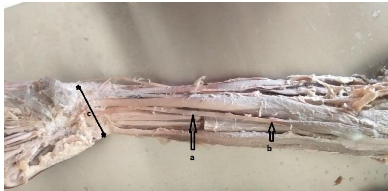
Fig. 1: Measurement of length of tendon of Palmaris longus