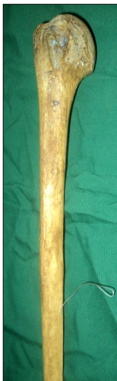
Fig. 1: Photograph showing location of nutrient foramen in humerus