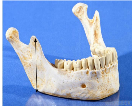
Fig. 2: Photograph showing measurement of ramus-distance between coronoid process and angle (c)