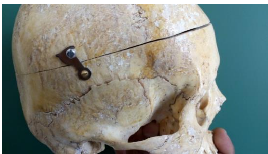
Fig. 3: Stellate type of pterion