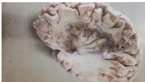
Fig. 1: Insular cortex gyri: 1-transverse gyrus, 2-accessory gyrus, 3-anterior short gyrus, 4- middle