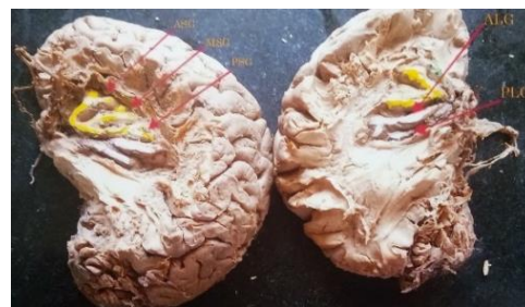
Fig. 2: Left side insular cortex: anterior short gyrus, middle short gyrus, Posterior short gyrus, All 3 Short gyri BIFID. Right side insular cortex: anterior long gyrus BIFID, Posterior long gyrus hypoplastic

Posterior peripheral sulcus (PPS) = from Posterosuperior insular point to Posteroinferior insular point.