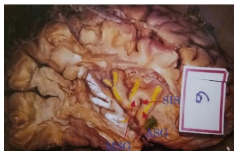
Fig. 5: Discontinuous Short insular sulcus & joined Anterior and Middle short gyrus (specimen No. 6 right).