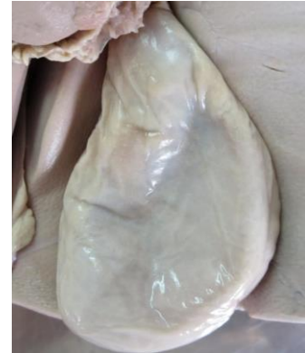
Fig. 1: Pear shaped gall bladder