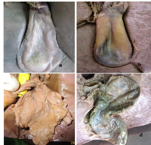
Fig 2: Different shapes of gall bladder: a) Flask shaped b) Cylindrical shaped c) Irregular shaped d) Hour glass shaped