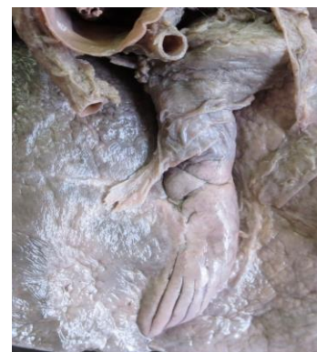
Fig. 3: Intrahepatic gall bladder