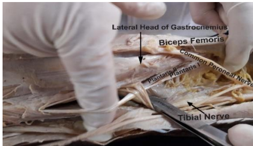
Fig. 2: Double Belly of Plantaris Muscle

heads were fused and inserted normally. Nerve supply of both the heads was from nerve to lateral head of gastrocnemius, branch from tibial nerve.