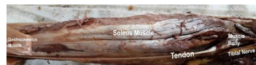
Fig. 1: Plantaris Muscle

Total lower limbs studied-50 (25 Cadavers-19 Males and 6 Females) The muscle in 48 lower limbs originated normally from the lower part of lateral supracondylar line of femur. (Fig.1) In two cases variations in origin of muscle were seen: