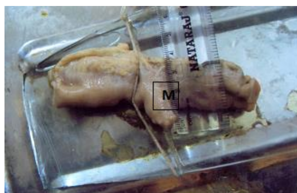
Fig. 1: Photograph showing the Meckel's Diverticulum (M)

On examination, the resected part of Ileum showed the Meckel's diverticulum two feet away from Ileocaecal junction and the length was nearly two centimeter with little finger breadth. It was supplied by Ileal branch of superior Mesenteric artery as usual. The diverticulum did not reveal any evidence in favour of inflammatory disorder. The tissue of diverticulum and adjacent Ileal tissue were subjected for the histological study. (Fig. 1)