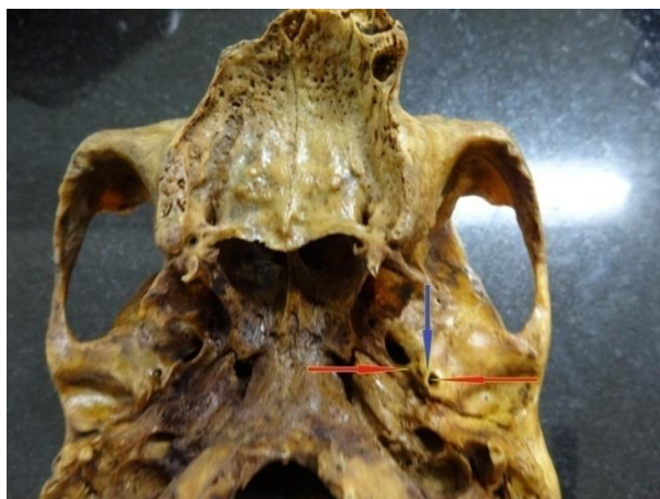
Fig. 4: Blue arrow indicates bony septum dividing the foramen spinosum, Red arrow indicates duplication of foramen spinosum