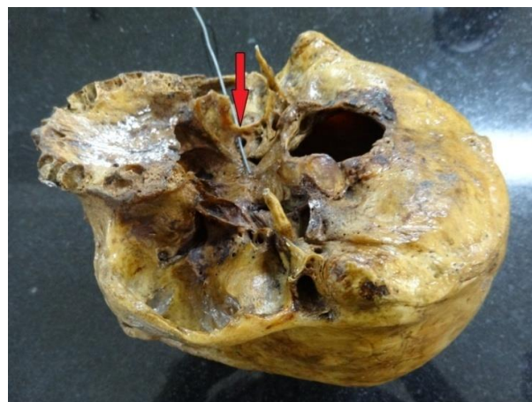
Fig. 2: The arrow points to the ossified pterygospinous ligament