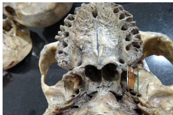
Fig. 5: White arrow indicates unilateral presence of left foramen Vesalius located medial to the duplicated foramen ovale orange arrow green arrow indicates foramen spinosum

Foramen of Vesalius: Foramen Vesalius is an inconsistent foramen which was present in 10 skulls (Fig. 5) among 64 skulls. Out of 10 skulls 7 skulls showed this foramen bilaterally and unilaterally in 3 skulls. The mean diameter of this foramen on right was 1.34mm and on left side was 1.98mm.