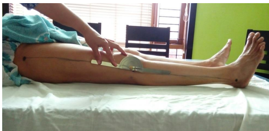
Fig. 2: Alignment of goniometer in supine position

Positioning: The fulcrum was located on the lateral epicondyle of femur. The proximal arm is associated along the line extending from lateral epicondyle to greater trochanter and the distal arm along the line extending from lateral epicondyle to lateral malleolus. The location of fulcrum is confirmed above the estimated position of the axis of motion. Fulcrum should be tuned accordingly to manage the movement changes during motion.