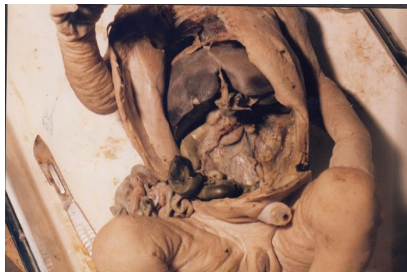
Fig. 2: Right Renal agenesis in male fetus

There was agenesis observed in the right kidney and ureter. The right supra renal gland was very small in size, though the left kidney, ureter and the supra renal gland were normal (Fig. 2).