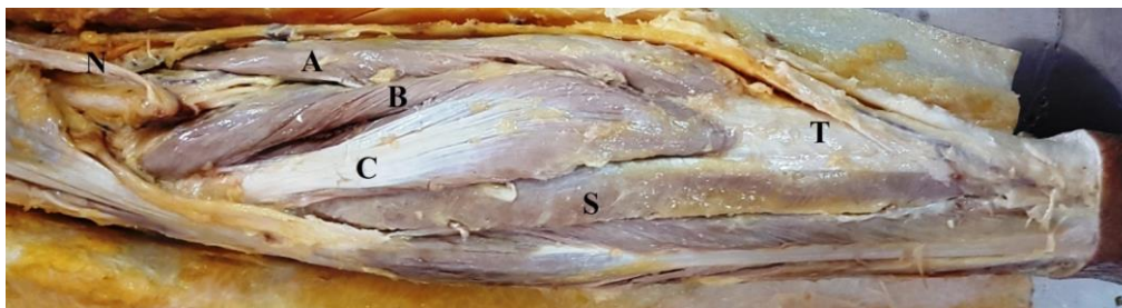
Fig. 1: Showing three headed gastrocnemius: A – Medial head of gastrocnemius, B – Additional medial head of gastrocnemius, C – Lateral head of gastrocnemius, D – Additional lateral head of gastrocnemius, T – Achilles tendon, S – Soleus and N – Tibial nerve