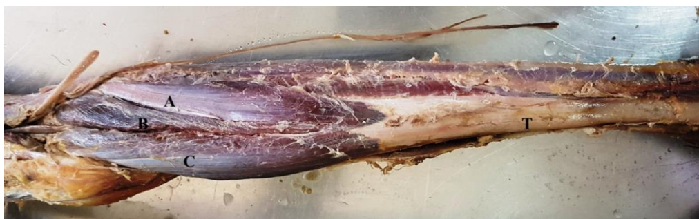
Fig. 2: Showing three headed gastrocnemius: A – Medial head of gastrocnemius, B – Additional medial head of gastrocnemius, C – Lateral head of gastrocnemius, D – Additional lateral head of gastrocnemius and T – Achilles tendon