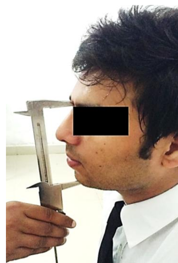
Fig. 2: Method of Taking the Facial Height