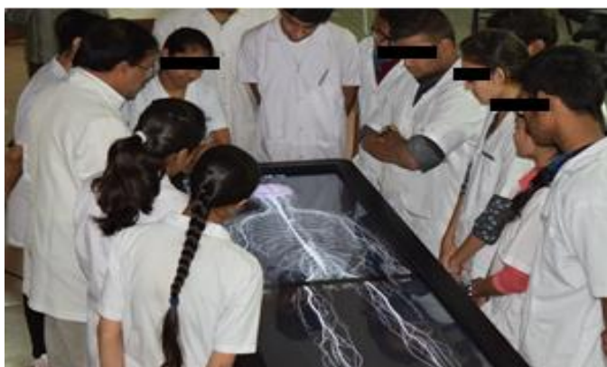
Fig. 2: Students using "Anatamage" virtual dissection table to learn neuroanatomy