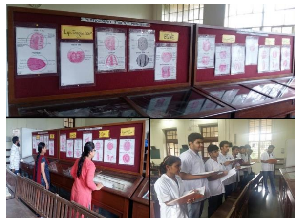
Fig. 6: Charts displayed on the notice board