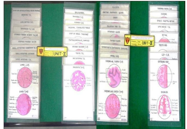
Fig. 4: List of charts of systemic microanatomy (Unit- 2 & 3)