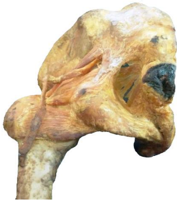
Fig. 10: Plastinated specimen of ischiorectal fossae