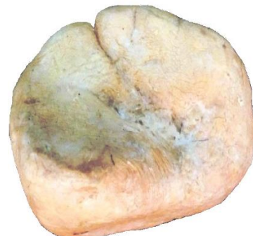
Fig. 8: Plastinated specimen of spleen