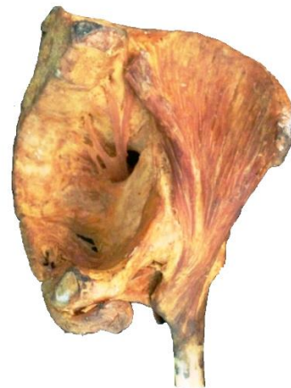
Fig. 6: Plastinated specimen pelvis