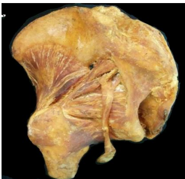
Fig. 12: Plastinated specimen of gluteal region