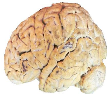
Fig. 7: Plastinated specimen of brain