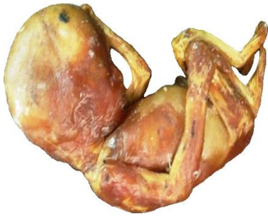
Fig. 9: Plastinated specimen of foetus