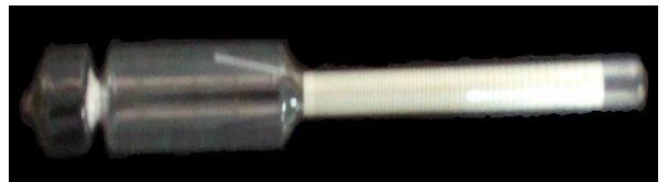
Fig. 1: Acetonometer

Future scope: Plastination is carried out in many institutions worldwide and has obtained great acceptance particularly because of the durability. Plastinated specimens can be repeatedly handled by students without causing any body reactions of chemicals and can be stored for years together. Plastination with different types of resins can be tried in future to reduce the cost of this technique.