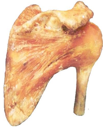
Fig. 5: Plastinated specimen of scapular region