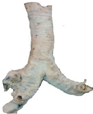
Fig. 3: Plastinated specimen of trachea