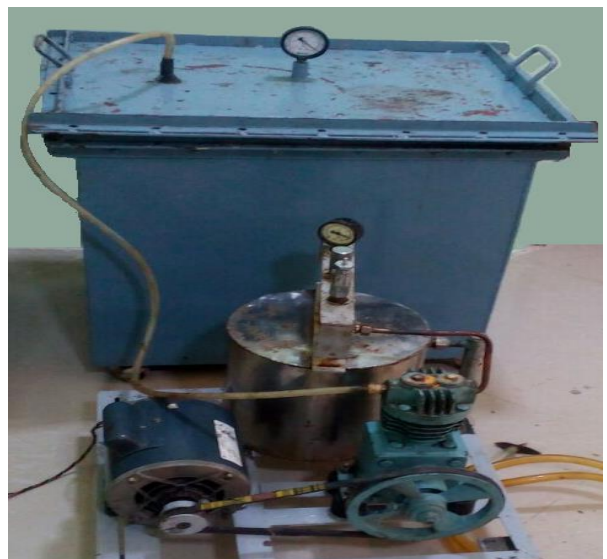
Fig. 2: Steel Vacuum chamber designed in Govt. Theni Medical College