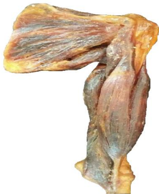
Fig. 4: Plastinated specimen of arm