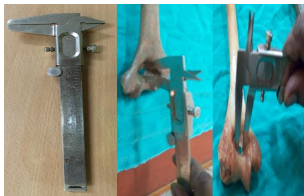
Fig 2: Measurement of vertical and transverse diameter of STF using the vernier calipers