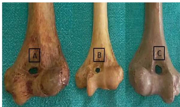
Fig 3: Showing (A) Oval (B) Round (C) Triangular shape of STF from anterior aspect

Out of 108 bones studied, we observed Supra trochlear foramen in 34 humerii with incidence of 31.4%. The occurrence of supra trochlear foramen on the right side was 10.1% (11 out of 34) and on the left side was 21.3% (23 out of 34). The study shows the frequency supra trochlear foramen on left side is more common (Table 1). In 74 humerii (68.6%) the supra trochlear foramen was absent.