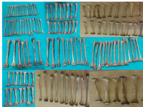
Fig. 1: Showing the master picture of 108 humerii

transmitted light from posterior to anterior. The variations of the STF, its different shapes and diameter and translucency of supra trochlear septum were documented, tabulated and photographed.