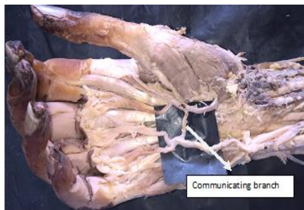
Fig. 3: Shows H-shaped Superficial palmar arch

One hand showed radio-ulnar type of SPA with equal contribution from both the arteries and two arteries are connected by a communicating branch which gives an H-shaped appearance as shown in Fig. 3. The ulnar artery showed comparatively larger diameter than its counterpart in 60 hands (87%). The radial and ulnar arteries were equal sized in 6 hands (9%) and larger radial artery was found in 3 hands (4%). These 9 hands showed classical radio-ulnar SPA or type A arches.