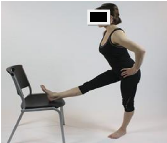
STANDING HAMSTRING STRETCH

discontinuation of stretching protocol. The whole study was conducted at NIMS medical college, Jaipur.