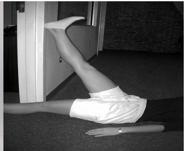
SUPINE HAMSTRING STRETCH