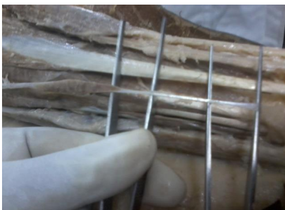
Fig. 3: Slender rounded Palmaris longus tendon

Slender rounded palmaris longus tendon: Thread like, slender rounded Palmaris longus tendon was observed in 2 cases. Muscle belly was very slender and Short (Fig. 3).