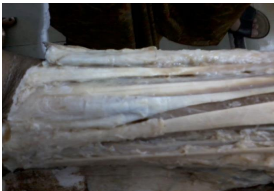
Fig. 2: High aponeurosis of the Palmaris longus muscle

This type of variation of Palmaris longus tendon expansion in the forearm has not been reported so far.