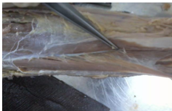
Fig. 5: Fusion of palmaris longus muscle belly with the flexor digitorum superficialis muscle

Fusion of palmaris longus muscle belly with the flexor digitorum superficialis muscle: The muscle belly of Palmaris longus fused with the muscle belly of the flexor digitorum superficialis throughout its entire extent. The picture shows that the Palmaris longus muscle is split open from the flexor digitorum superficialis (Fig. 5).