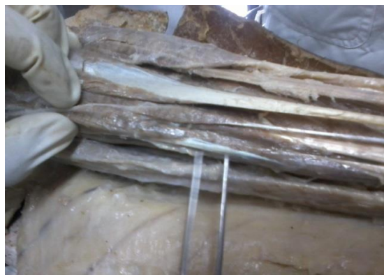
Fig. 4: Palmaris longus with 2 muscle bellies

Digastric palmaris longus muscle with a single tendon: Intermediate tendon with two muscle bellies-Upper and Lower. There are present in the upper half of the forearm. In the lower half of forearm the Palmaris longus tendon was normal and in the palm the formation of aponeurosis was noted (Fig. 4).