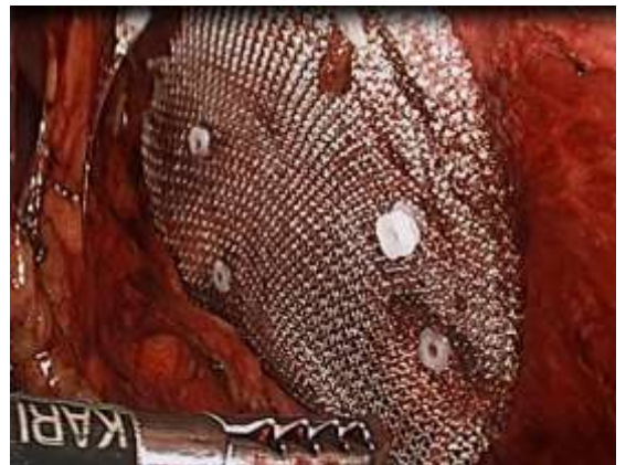
Fig. 5: Polypropylene mesh (10x10 cm) fixed with tackers