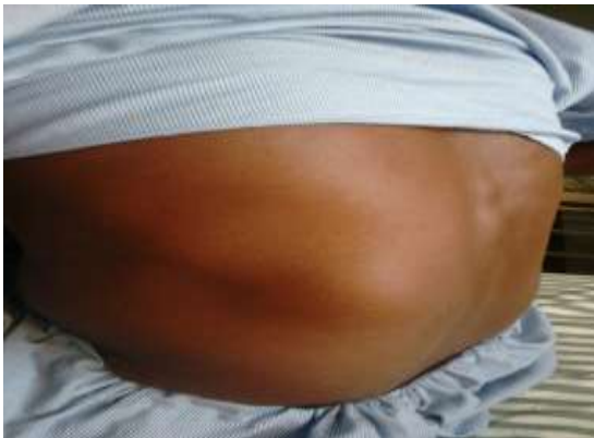
Fig. 1: Swelling in left flank region

was placed just lateral to umbilicus and two 5 mm working ports were also placed, one below left costal margin and second in left iliac fossa, (Fig. 3). Peritoneal mobilization was started along the line of Toltd and retroperitoneal dissection was done. The hernia defect was identified (size about 2.5x2.0 cm) (Fig. 4). Extra peritoneal fat was seen to be herniating through this defect. The hernial contents were reduced and margins were well defined. A 10 x10 cm polypropylene mesh was fixed with the help of tackers (Fig. 5). Reperitonealisation was completed and port sites were closed. Patient was advised to be on liquid diet on the evening of surgery and was discharged on fourth postoperative day. At follow up of three months patient is healthy asymptomatic and fine without any complaints.