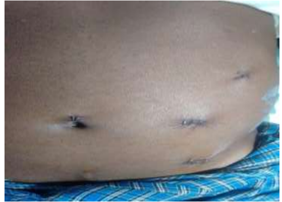
Fig. 3: Port placements