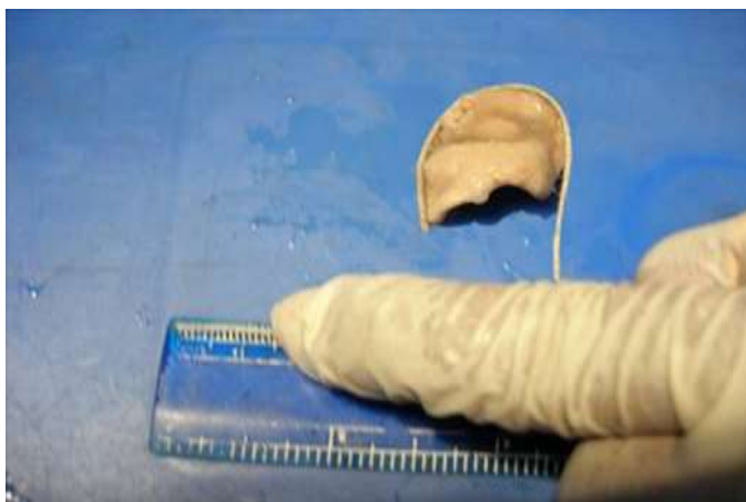
Fig. 1: Measurement of the length of the adrenal gland using a thread and ruler

Significant positive correlation exist between all the parameters namely height, length and thickness with the gestational age ( p < 0.001 ). Pearson's correlation showed a significant positive correlation between the weight of the suprarenal glands and the gestation age ( p < 0.001 ) (Fig. 3). Simple linear regression analysis was also done which showed that the weight of the suprarenal gland regressed with the gestational age of the fetus. It was also observed that from 14 to 36 weeks of gestational age, for every 1 week increase in the gestational age, the weight of the suprarenal gland increased by a factor of 0.125 gm (Table 2).