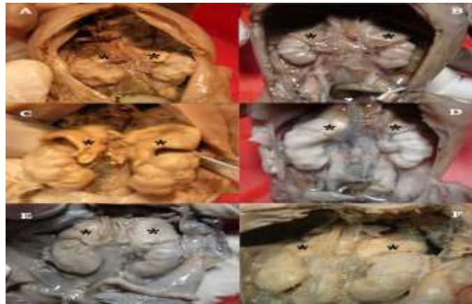
Fig. 2: Dissected fetal abdomen showing the suprarenal glands (*) in various gestational ages. A–14weeks, B–16weeks, C–20weeks, D–24weeks, E–26weeks, F–30weeks. Note the predominant tetrahedral shape of the right and crescentic shape of the left suprarenal glands