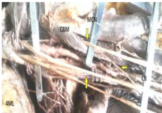
Fig. 1: (4ML) Shows communicating branch(CB) between musculocutaneous nerve(MCN) and median nerve below coracobrachialis muscle(CBM)