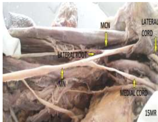
Fig. 3: (15MR) Shows median nerve (MN) as a medial cord and later joined by fibres of lateral cord from musculocutaneous nerve(MCN)