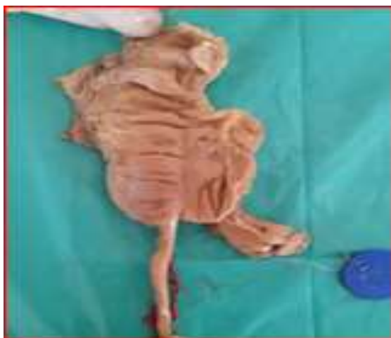
Fig. 2: Showing midinguinal or 6o clock position

The position of appendix in 20 specimens (71.4%) were retrocolic or retrocaecal and 12 o clock position as shown in Table 3. In one specimen the appendix showed mid inguinal or 6 o clock position as shown in Fig. 2 the length of appendix varied from 42 mm to 136 mm the lengthiest as shown in Fig. 3. The average length of appendix is 76.7mm the double or duplicate appendix was seen in one specimen as shown in Fig. 4.