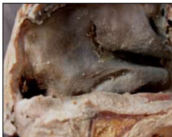
Fig. 1: Broad and posteriorly displaced middle turbinate and obliquely grooved inferior turbinate

d2 = Distance between lowermost portion of limen nasi and anterior attachment of superior turbinate.