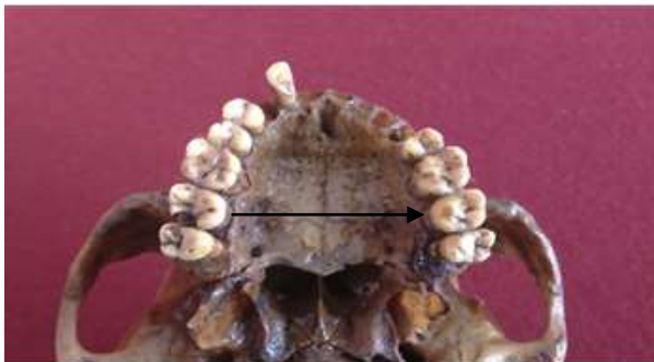
Fig. 2: Shows the maximum width of the hard palate is taken at the gingival margin of second molar tooth

Each reading was repeated twice by the same observer to avoid any manual error. The data obtained was statistically analysed.