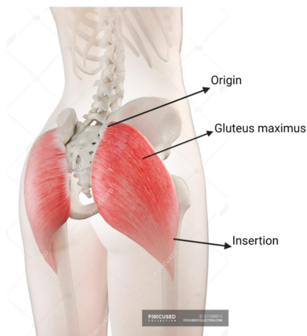
Anatomy of Gluteus maximus muscle Created by Biorender.com