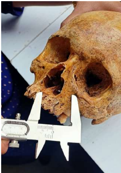
Fig. 3: Measurement of distance from anterior nasal spine to infraorbital foramen using vernier caliper