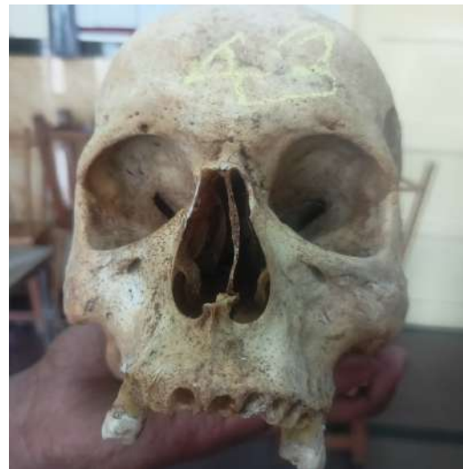
Fig. 6: Right side – Vertically oval, Left side – Transversely oval