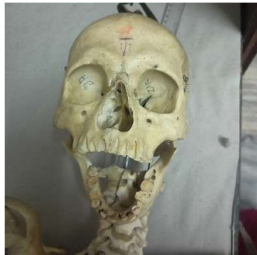
Fig. 5: Shape of IOF : Right – Triangular, Left - Semilunar