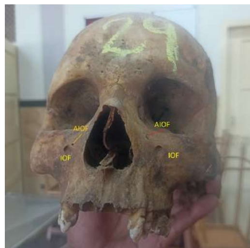
Fig. 7: Bilateral accessory foramen