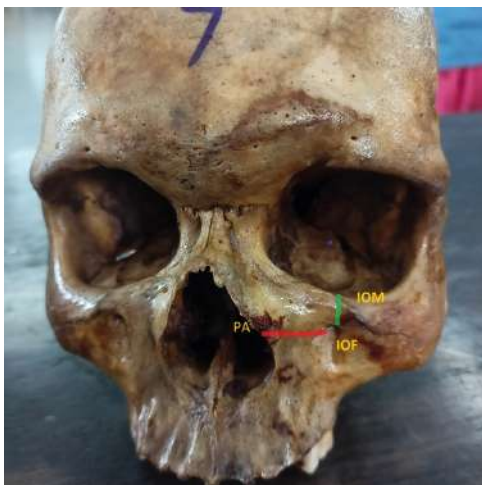
Fig. 4: Measurement of distance from Pyriform aperture (PA) and infraorbital margin to infraorbital foramen