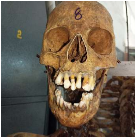
Fig. 8: Right side IOF direction – Medially downwards, Left side IOF shape - Triangular

The mean distance between superior margin of IOM and IOF is 6.58 \pm 0.28 mm on the right side & 6.78 \pm 0.233 mm on the left side. Maximum distance between superior margin of IOM to IOF 1.8 mm on the right side 1.8 mm on the left side (both on same skull). Minimum distance between IOM TO IOF 3 mm on the right side & 3 mm on the left side (on different skull).