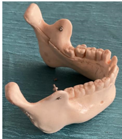
Fig. 2: Showing round shaped coronoid process

hook shape (30%) and rounded (3%). Triangular type was more prevalent in males (72.2%) than females (51.1%), whereas hook shape was more prevalent in females (44.9%) than males (25.2%). Rounded shape was more prevalent in females (4.1%) than males (2.6%). 3