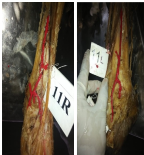
Fig. 3: Anterior tibial artery was found on lateral side of leg