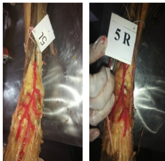
Fig. 2: Dorsalis pedis artery was replaced by perforating branch of peroneal artery

In specimen number 11RF and 11LF. Variation was observed, that is anterior tibial artery was found on lateral side of leg, dorsalis pedis artery is a continuation of the anterior tibial artery seen passing above lateral malleolus and then it passes forwards along the lateral side of the dorsum of the foot. It crossed inferior extensor retinaculum, below extensor digitorum longus and finally reached the proximal end of the intermetatarsal space.