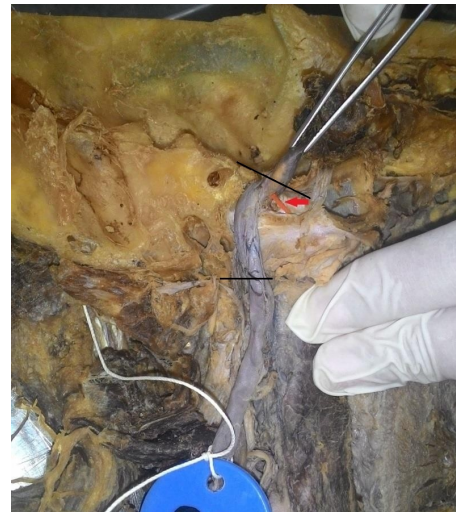
Fig. 1: Petrous part of ICA (between the 2 black lines), red arrow – artery of pterygoid canal

The mean length and diameter of the petrous and cavernous parts of the ICA are given in Table 1.