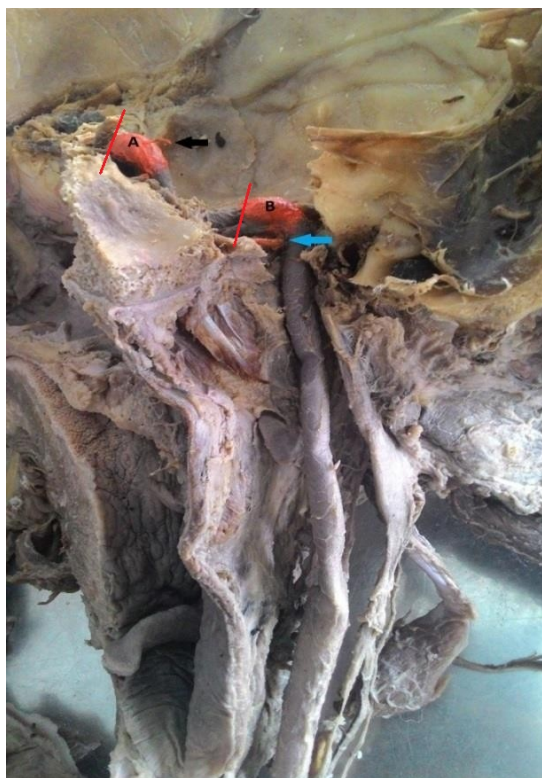
Fig. 2: Cavernous part of ICA between the two red lines blue arrow - artery of pterygoid canal, black arrow - meningo-hypophyseal trunk; A- terminal segment of cavernous part; B- terminal segment of petrous part

The above parameters showed no significant side differences.