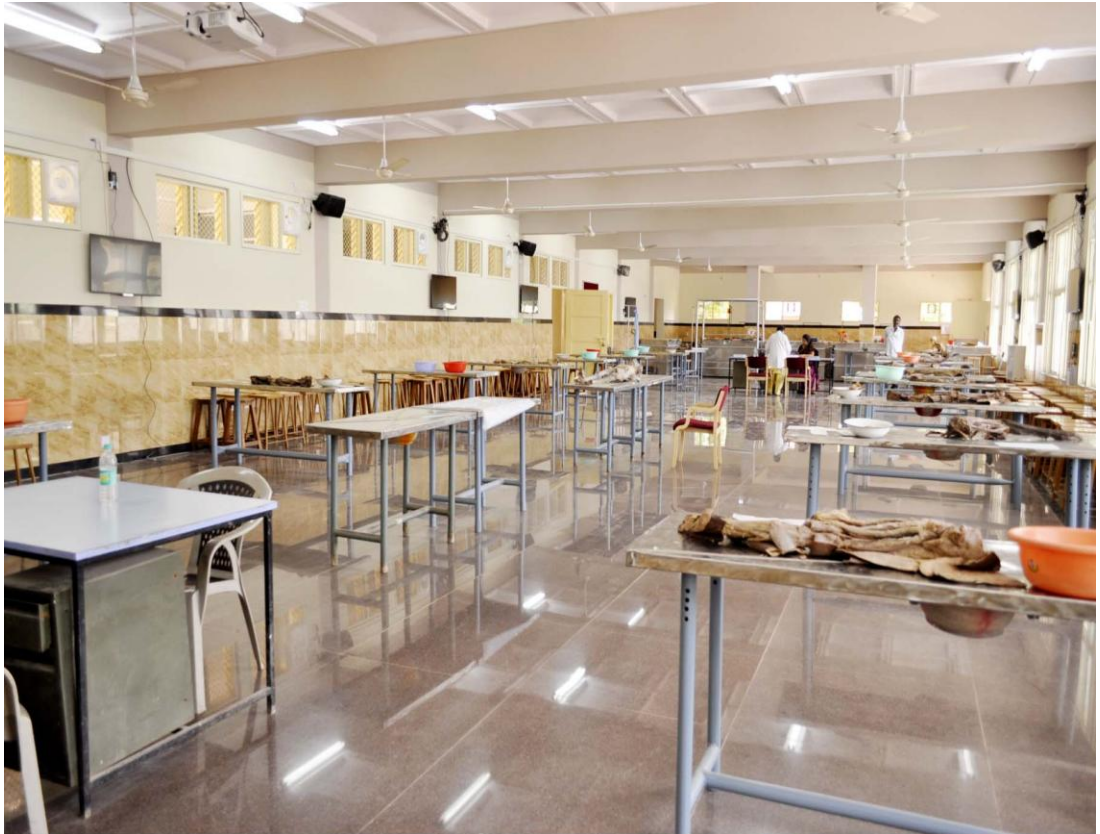
Image 1: Dissection theatre in Department of Anatomy, JSS Medical College