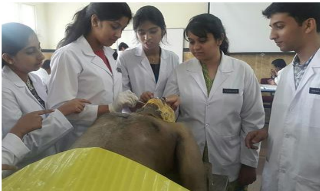
Image 3: showing dissection of concerned topics of participant students