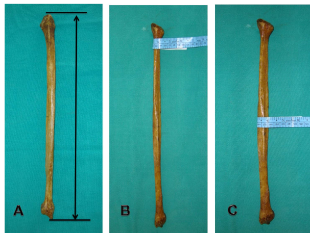
Fig. 1: Osteometric measurements of fibula A: Maximum length, B: Neck circumference, C: Mid-shaft circumference

Mean values and Pearson correlation coefficient values were calculated and the results tabulated.