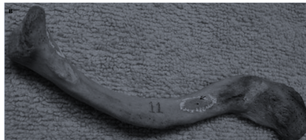
Fig. 1: Clavicles showing the nutrient foramen at the inferior surface

the entrapped nerve relieved symptoms in both patients. Fibrous and muscular structures in addition to nutrient canal contents could also be an Anatomical basis for the supraclavicular nerve entrapment syndrome as suggested by Jelev and Surchev. 8