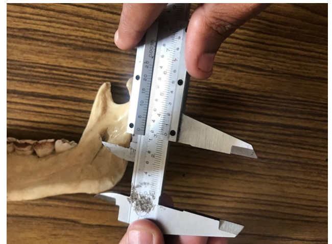
Fig. 2: Shows parameters measured

RS-MF: distance from the midpoint of posterior margin of mandibular foramen to the nearest point on the posterior border of the ramus of mandible.