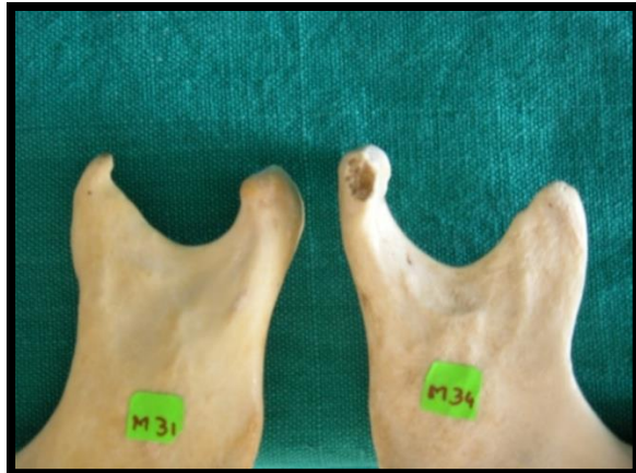
Fig. 5: Hook shaped coronoid process subvarieties based on notch