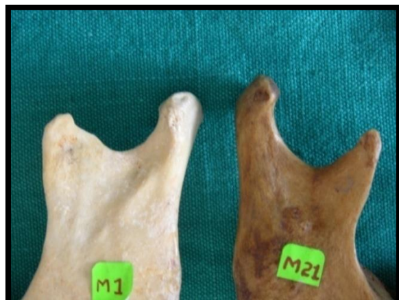
Fig. 6: Hook shaped coronoid process sub varieties based on base breadth