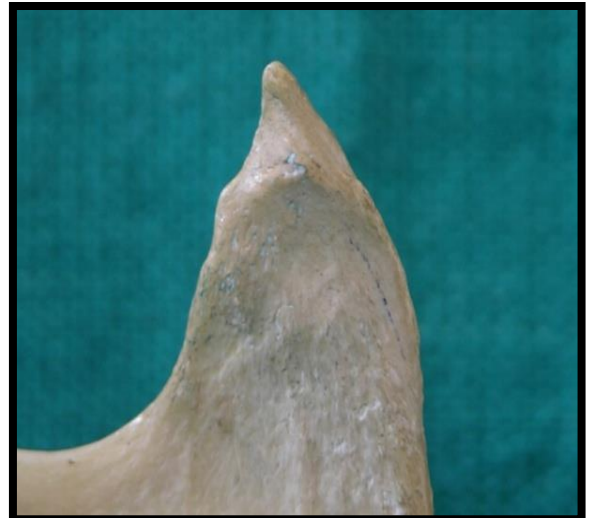
Fig. 3: Hook shaped coronoid process