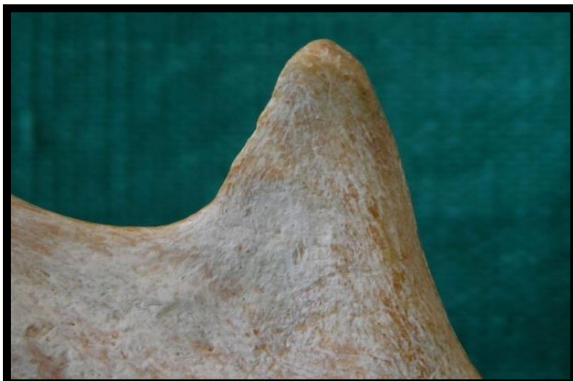
Fig. 1: Triangular coronoid process

The collected samples were analyzed regarding their shape and configuration which were later compared with various studies for their statistical significance using Chi-square test.