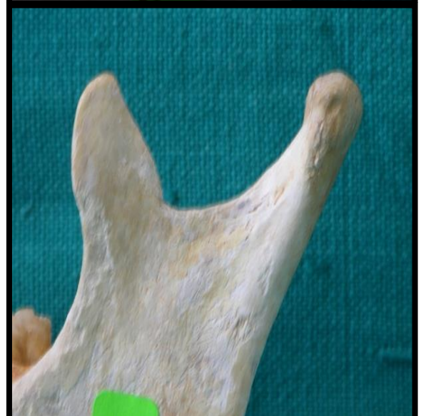
Fig. 4: Miscellaneous coronoid processes