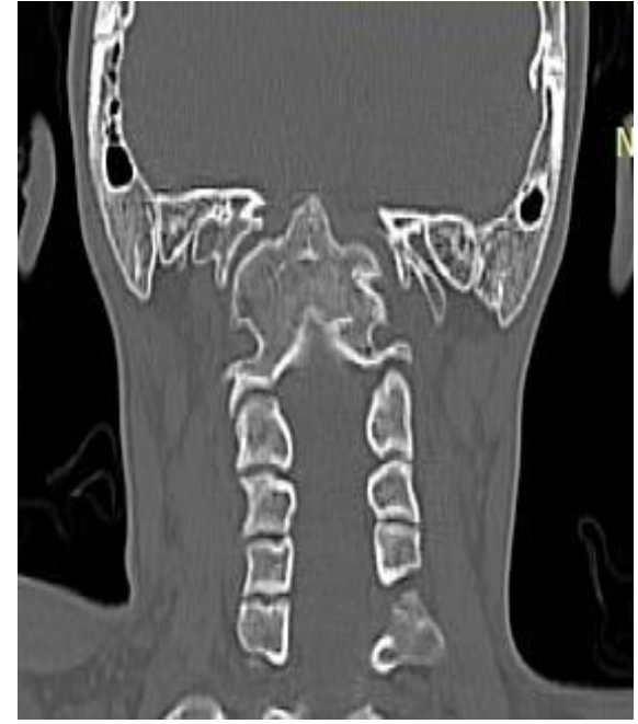
Fig. 2: CT scan showing atlanto occipital assimilation

Indian Journal of Clinical Anatomy and Physiology, April-June, 2019;6(2):148-152