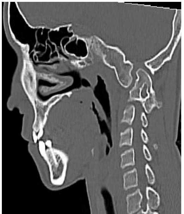
Fig. 4: CT scan showing atlanto axial fusion