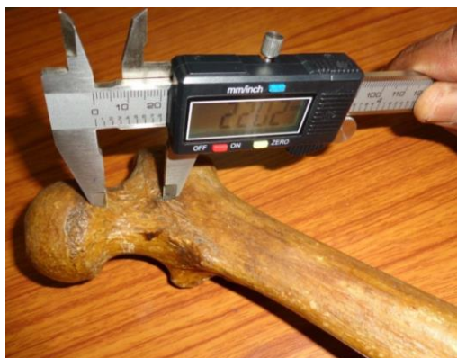
Fig. 4: Length of neck anteriorly