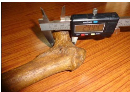
Fig. 6: Width of neck supero inferiorly