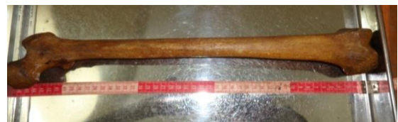
Fig. 1: Measuring length of femur

The length of the neck is measured anteriorly between the base of the head and midpoint of intertrochanteric line (Fig. 4). Posteriorly the length is measured between the base of head and midpoint of intertrochanteric crest (Fig. 5). The width of neck is measured supero inferiorly (Fig. 6) and anteroposteriorly. The results are represented in table 2, and these measurements are compared with dimensions of the presently available implants in table 3.