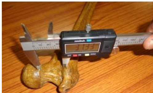
Fig. 5: Length of neck posteriorly