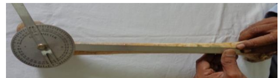
Fig. 2: Measuring neck-shaft angle of femur