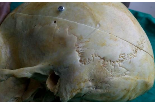
Fig. 5: Type I asterion