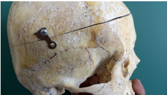
Fig. 3: Stellate type of pterion