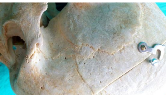
Fig. 4: Epiptereric type of pterion