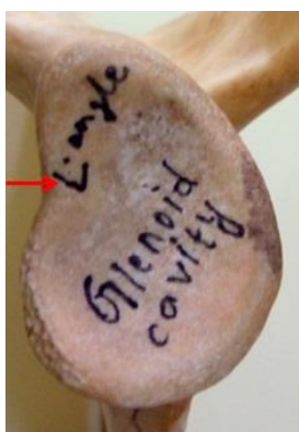
Fig. 2: Pear shaped glenoid fossa of left scapula with Red arrow pointing towards the deep notch on the anterior margin of the glenoid fossa