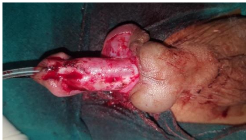
Fig 2: After tubularization of incised urethral plate

Mean age of patients in our study group was 4 years. Meatal position was subcoronal in 16, distal penile in 12 and mid penile in 2 patients. Patients with good preputial hood, absent or minimal chordee and well formed urethral plate (>5mm in width) were included in study group. The patients with severe chordee and inadequate urethral plate were excluded.