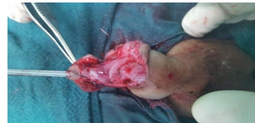
Fig. 4: De-epithelized flap placed over suture line of neo-urethra and anchored with 5-0 Vicryl stitches

Water-proofing layer was laid over the suture line of urethroplasty and anchored in place by few 5-0 Vicryl stitches (Fig 4). Skin cover was done by Bayar's method. First check dressings were done on day 5 (Fig 5). Catheter was removed after 10 days of repair.