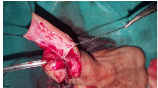
Fig 3: De-epithelization of inner preputial skin

held with 4 stay sutures (Fig. 3). This dermal pedal was raised as flap pedicled over Dartos fascia.