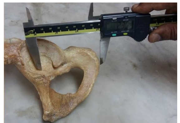
Fig. 6: Length of ischium: (ON) maximum distance between the morphological centre of the acetabulum & ischium measured with sliding caliper