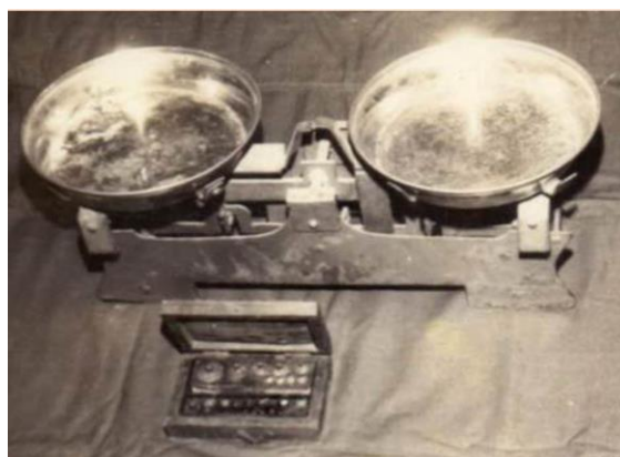
Fig. 1: Ordinary weighing balance (sensitive to 0.5gm)

The limiting points of calculated range (Mean \pm 3SD ) as Demarking point (DP) for each measurement which covered the 99.75% of the samples. These Demarking points (DP) provides reasonable accuracy in identifying the sex of the hip bones. [1]