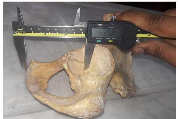
Fig. 5: Length of pubis: (OM) maximum distance between the morphological centre of the acetabulum & pubis measured with sliding caliper