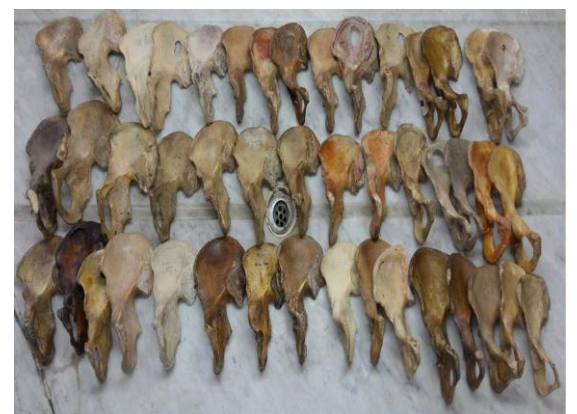
Fig. 7: Male right hip bones (45)