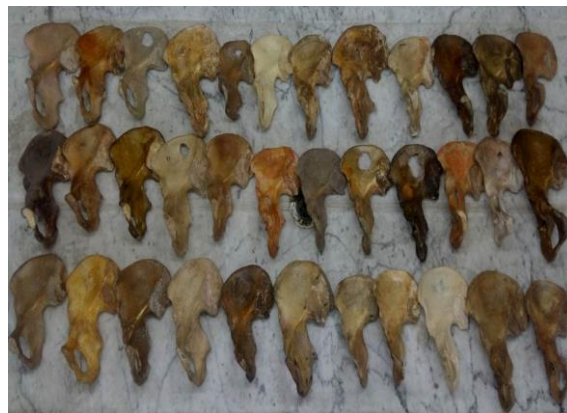
Fig. 10: Female right hip bones (35)