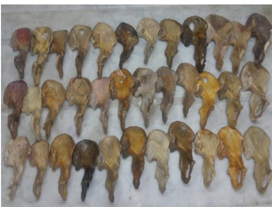
Fig. 9: Female left hip bones (35)