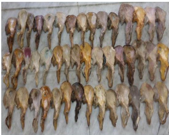
Fig. 8: Male left hip bones (45)