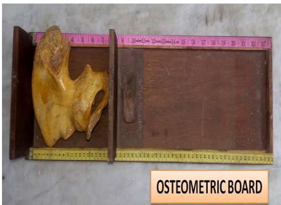
Fig. 3: Measurement of length of the hip bone (AB)