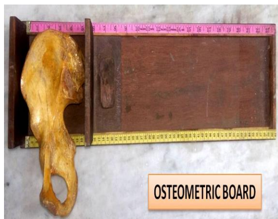
Fig. 4: Measurement of breadth of the hip bone (CD)