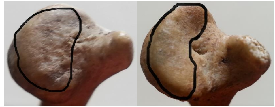
Features ----- No Vascular Foramina and Different Shapes of Pole