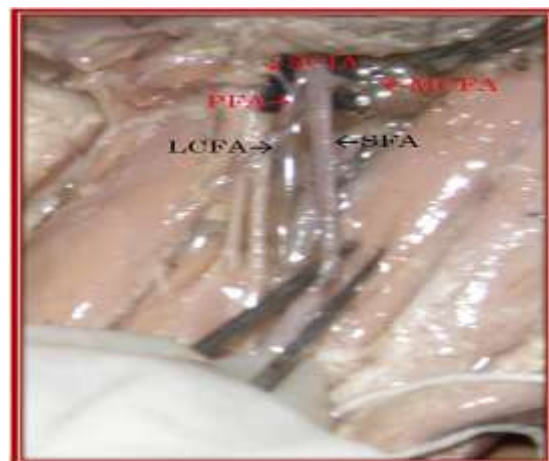
Fig. 4: Showing double FA

FA – Femoral artery; SEPA– Superficial external pudendal artery; SCIA- Superficial circumflex iliac artery; SEGA–Superficial epigastric artery; DEPA - Deep external pudendal artery; PFA – Profunda femoris artery; LCFA – Lateral circumflex femoral artery; MCFA – Medial circumflex femoral artery; PS – Pubic symphysis; ASIS – Anterior superior iliac spine.