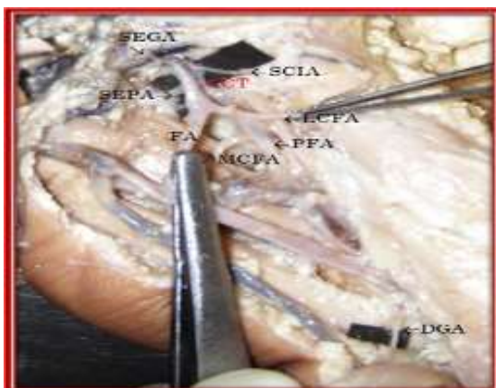
Fig. 1: Showing SCIA & SEPA arising from a common trunk

lateral circumflex femoral arteries were arising from femoral artery and superficial circumflex iliac artery was arising from profunda femoris artery. It was looking like double femoral artery. (Fig. 4)