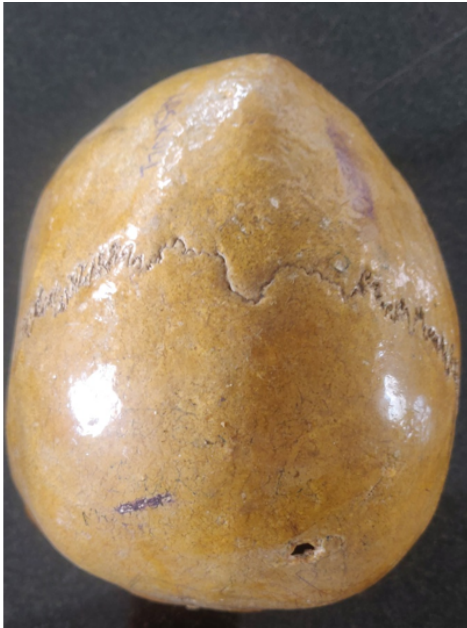
Fig. 2: Superior view