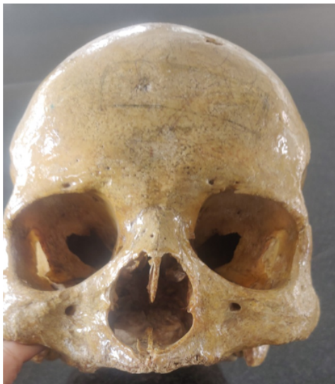
Fig. 3: Frontal view

The embryonic skull starts to grow nine weeks after fertilization. At nine weeks, the base of the skull has developed along with the sphenoidal wings, cribriform plates, dural attachment to crista galli, and petrous ridges. Early brain growth occurs at these locations, which dural bands reflect off of. By 12 weeks, ossification had taken place in the dura mater region between the main bands. Bone extends in all directions toward the dura from these core locations. By 16 weeks, the development has almost completely covered the main dura bands, but fontanelles are still present where the bone growth has not yet reached.