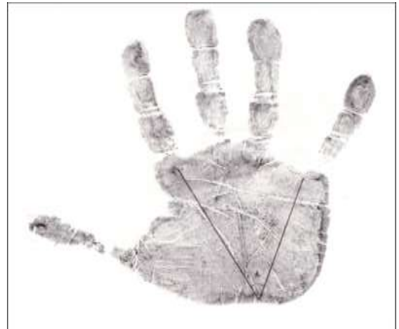
Fig. 2: Showing atd angle

In the present dermatoglyphic study, fifty male and fifty female bipolar cases were compared with the same number of normal adults devoid of any mental disease. Members from the same family were excluded. The study was aimed at establishing a correlation between occurrence of bipolar affective disorder and the dermatoglyphics of hand which depends on genetic factors. The TFRC and a-b ridge counts were found to be decreased in the bipolar diseased group. The mean 'atd' angle on both the hands considered together is found to be greater in the bipolar cases compared to the normal i.e. 90.22° in males and 92.46° in females bipolar cases compared to the control with mean angle 80.46° and 82.46° respectively in males and females (in males p= 0.0001, in females p= 0.0002). The frequency of whorls were increased in patients compared to the controls (p<0.001).